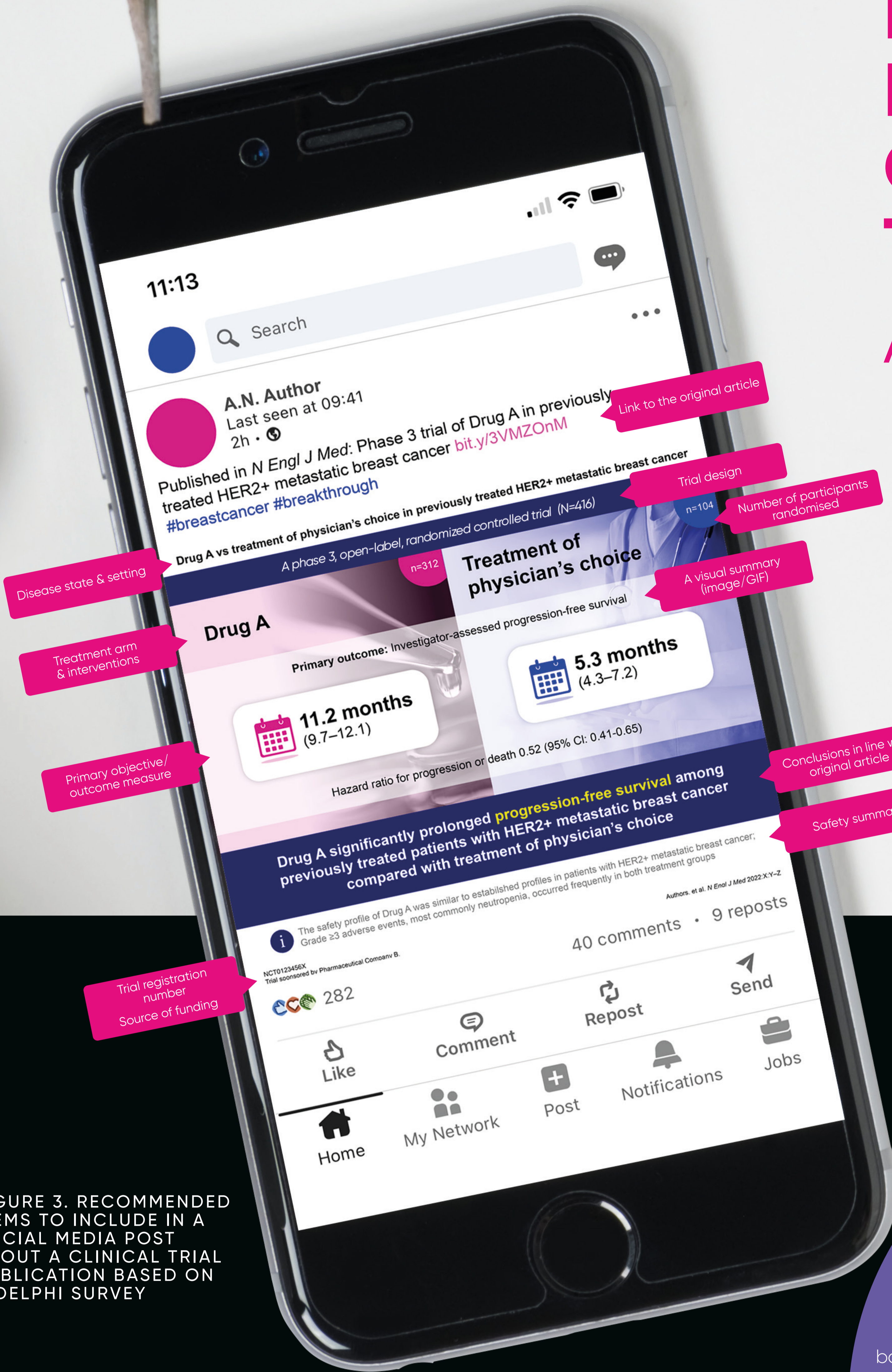
FIGURE 3. RECOMMENDED ITEMS TO INCLUDE IN A SOCIAL MEDIA POST ABOUT A CLINICAL TRIAL PUBLICATION BASED ON A DELPHI SURVEY